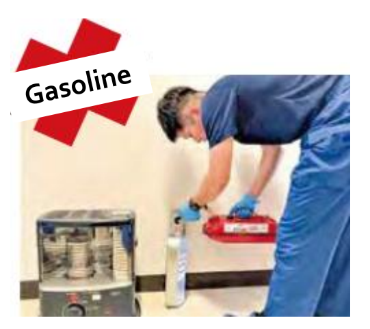
Storing gasoline and kerosene in the same place is a big reason why people fill up the wrong gas into their appliances.