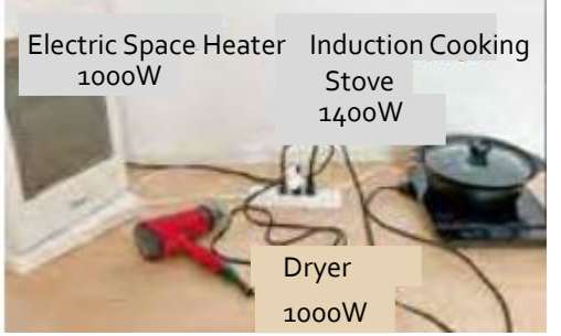
strip is 1500W.