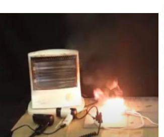
Overloading your current can The standard capacity of a power cause fires! Electrical Consumption 3400W > Set Capacity 1500W = Overloading!