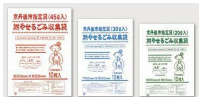
Burnable Trash 45L Burnable Trash 30L Burnable Trash 20L

Please use city-designated trash bags at the trash stations (Other kinds of bags will not be accepted)