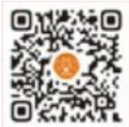
Kyotango Digital Point Website

By the Commerce and Industry Promotion Section TEL 0772-69-0440