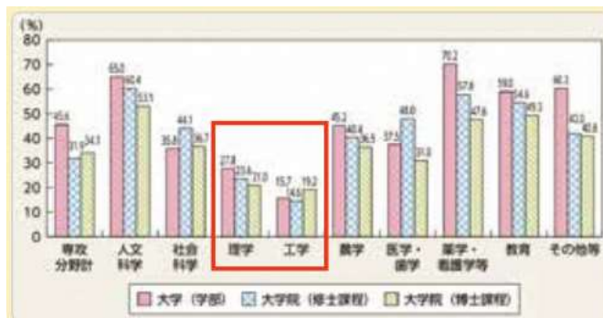
(left figure) Comparison graph of male and female software engineers according to JISA 2022 Information Service Industry Survey