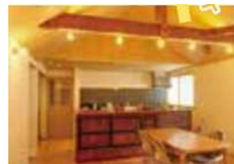
A chic sharehouse!

Shimazu District has improved their system for accepting new residents in the area and established Shima Shima Base, an organization of local residents whose role is to revitalize and enliven the local area. From organizing events like seed planting/harvesting and markets for kids to learn business skills, to establishing a contracting company made up of interested individuals from the district to renovate nearby vacant houses into shared housing units, Shimazu District is advancing on various initiatives collaborating with neighborhood associations, residential organizations, and contractors.