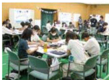
Students actively communicating with each other and finding more issues to tackle.