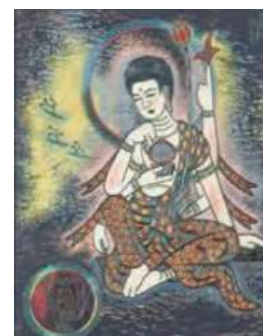
Nyoirin to fukuro "Nyoirin Bodhisattva and the Owl" (1944)