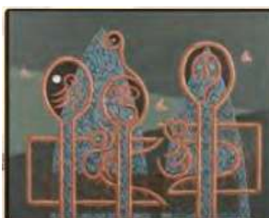
Choumonzukei "Avian-patterned Figure" (1941)

The Surrealist Art of Gentaro Komaki Omiya Fureai Workshop October 21 st ~ November 12 th