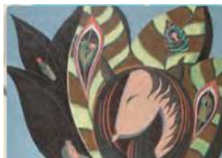
Oshiragamizu ( Kaikogamizu ) No.1 "Figure of the Silkworm God" (1948)