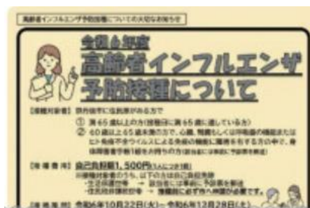
Influenza Vaccination for Seniors

By the Health Promotion Section TEL 0772-69-0350