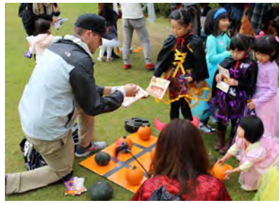
Learning the game rules (left)