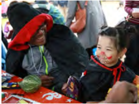
Face-painting experience !

With the cooperation of the Kyogamisaki Communications Site and CIRs, a Halloween event for children at elementary school level and below was planned.