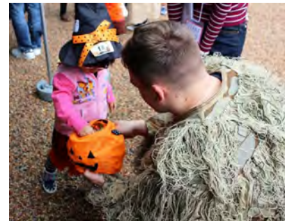
When you say trick-or-treat, you get a whole lot of candy!

Elementary schoolers participating with their friends gave us their impressions, saying “during the games and face-painting I was talked to in English. Even though I didn’t understand it all, it was a lot of fun!”