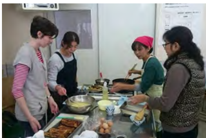
Cooperating in a group and making a good cooking effort

“Brunch” is a combination of the English words “breakfast” and “lunch,” so the mealtime and the menu are a combination of the two. The volume is also more than it appears, so everyone ended up very full!