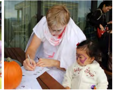
A scary monster drawing pictures (right)