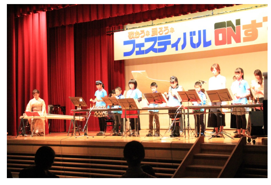
↑ Everyone in "Harmony Wakakusa" performing

The Amino Cultural Festival, "Festival on Stage," organized by the Kyotango Cultural Association, was held on November 13th in Amity Tango (Amino).