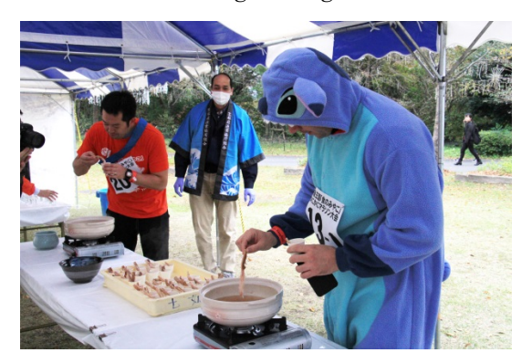
↑ Participants tasting crab at the "crab stations"

On November 6<sup>th</sup> in "Shoku-no-Miyako" Tango Kingdom (Yasaka), the Kani-kani Marathon celebrating the start of the snow crab fishing season was held for the first time. About ninety participants from inside and outside the city ran through the grounds.