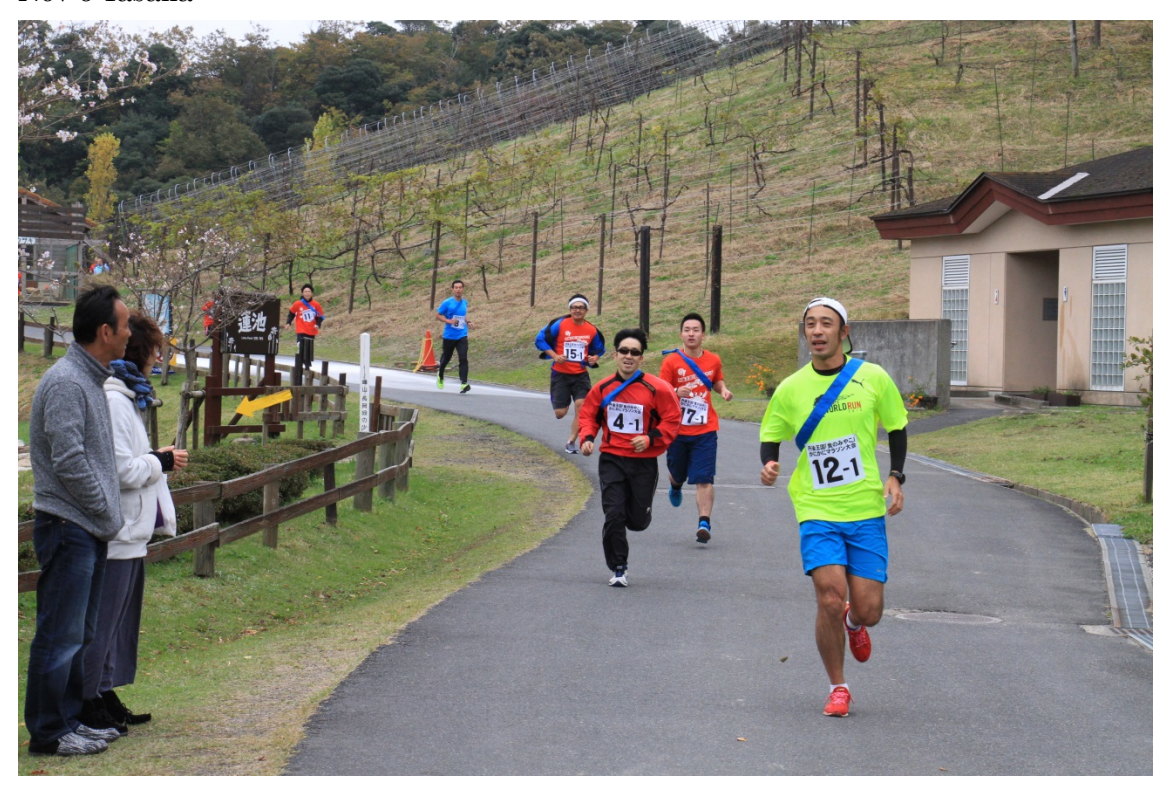
\ensuremath{\uparrow} Runners dashing through the course

Running While Eating Crab Kani-kani Marathon in "Shoku-no-Miyako" Tango Kingdom Nov 6 Yasaka