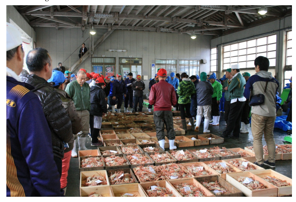
↑ Preparations for the first auction at Taiza Fishing Harbor

Snow Crab Fishing Begins: First Auction of the Year 5 Male Taiza Crabs Sell for ¥500,000 Nov 6 Tango