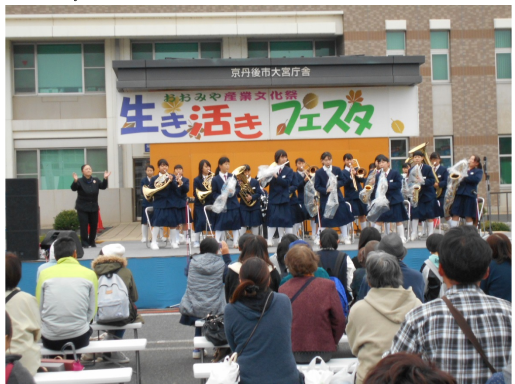
↑ Omiya Middle School Brass Band Club performs

On November 6<sup>th</sup>, in front of Omiya City Hall, the "Omiya Iki-Iki Festa 2016" (organized by an executive committee of the same name) was held, with the theme