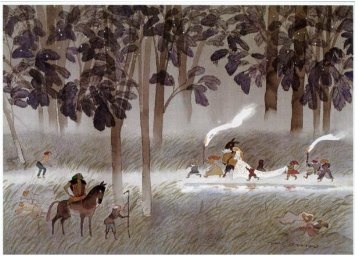
Scene from "Midsummer's Night Dream"

Closed on Tuesdays (If the holiday is on a Tuesday, the museum will be closed on Wednesday)